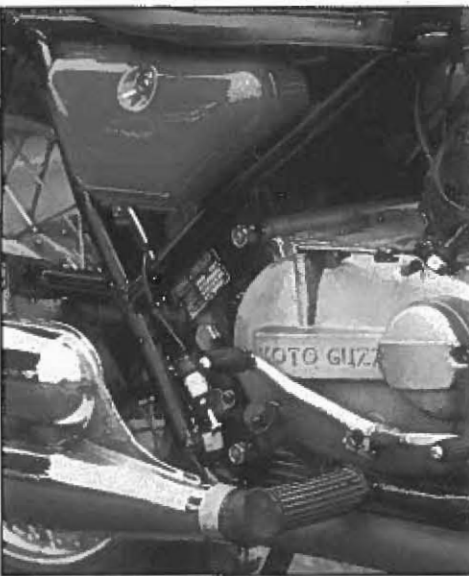
Top: alloy guard covers outside flywheel Above: small air filters replace original boxes

generator and the alloy binnacle above the CEV headlamp carries a full set of 'idiot lights' as well as the Veglia 160kph speedo. Some versions of this model offered electric starting, but Helmut and Walter find kick-starting no problem, even without the cable-operated valve lifter.