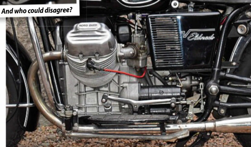
The left side of the engine is as handsome as the other side, but has the starter motor all to itself ... and a neat rocking heel'n'toe gear lever, too