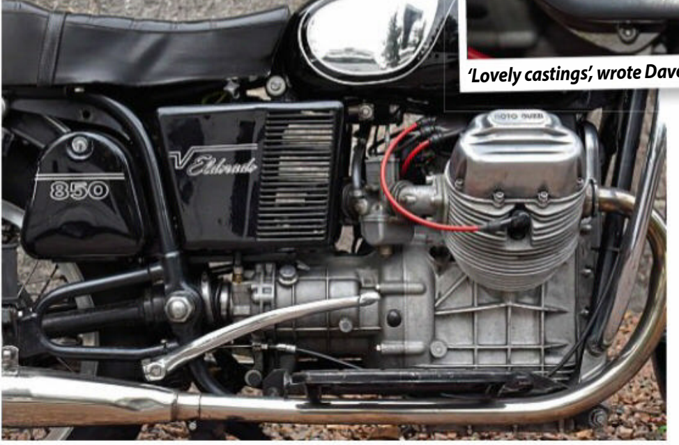
The right side of the engine is as handsome as the other side, but has the driveshaft all to itself

The 850 GT made for the sporty European market got a 4LS front brake which was an