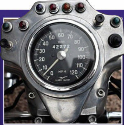
Relics of police service include the remarkable 'dashboard', the curiously situated ignition switch and the painted-over welding 'scar' left by removing the friction horn

miles, as there's no changeable oil filter.