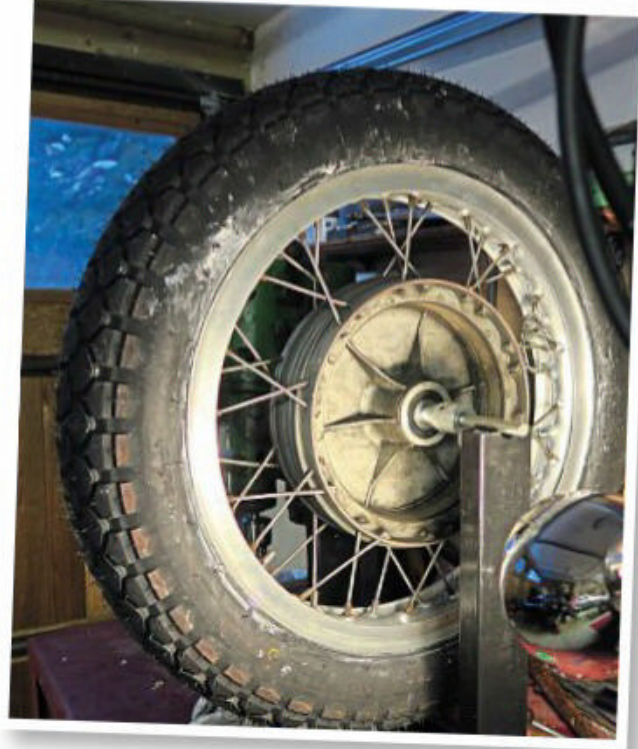
Things to do while it's snowing outside: wheel balancing!

One notable exception to my police purge is the footboards. I went to some lengths to find pegs, a suitable gearshift linkage and the correct rocker gear pedal to change over to footpegs... only to find that the footboards were hugely more comfortable for my 31" legs. It's just such a natural way to hold your legs and doubtless the USA police knew this. Before scoffing into your tiffin, you should know they are hinged to allow high angles of lean so there can be no rational